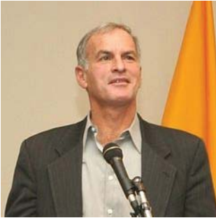
Dr. Norman Finkelstein

"This is an exciting and innovative Peace Studies programme. The structure of the programme allows for intensive investigation of specific topics relevant to Peace Studies. The students and staff are fully engaged in a critical and questioning approach to current debates and issues in international affairs that involves both theory and its practical application."