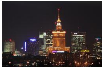
Warsaw by night