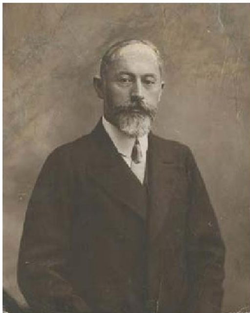
Noe Zhordania (1868-1953) Prime Minister of Georgia (1918-1921) Emigré in France (1921-1953)